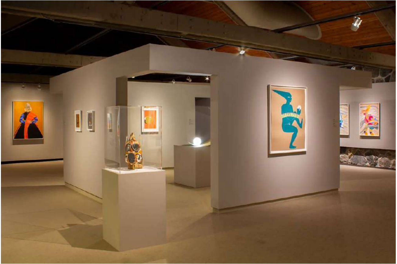
Installation view of Futures at the McMichael Canadian Art Collection.

Perera creates, Traveller is set in a sci-fi universe, and like other strong examples of the genre, its imaginary world isn't so different from our own.